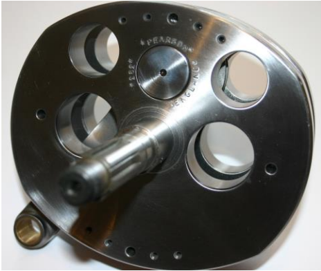
Pearson Oval Crankshaft

Specifications: 65tons sq in” chromium molybdenum steel needle roller big-end. Carrillo Con-rod all press fit, can be made you your specifications e.g. std, short or long stroke.