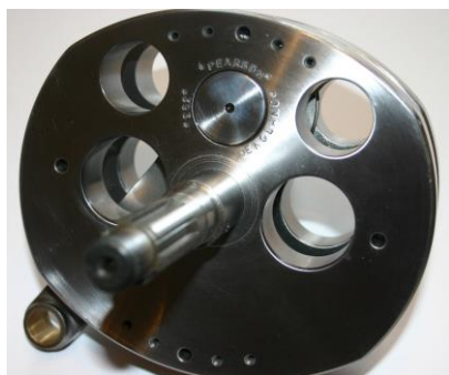
Pearson Oval Crankshaft

Specifications: 65tons sq in" chromium molybdenum steel needle roller big-end. Carrillo con-rod all press fit, can be made you your specifications e.g. std, short or long stroke.